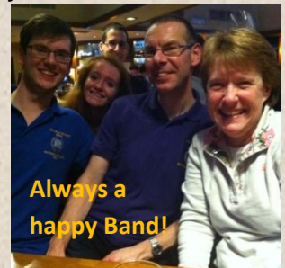
Always a happy Band!

There was a heady mix of confidence and nerves as we occupied the stage...and then we were off. The back row started the piece superbly, with the trombones following and euphonium and cornet getting us into the heart of the first movement. The piece went by in a blaze of accurate rhythms and exciting dynamics, and by the time we reached the end we all knew that we had played it the best we had yet. Back in the auditorium, waiting for the results, a wave of excitement went through our players and supporters as the brass band website, 4barsrest, predicted us to win! Unfortunately, though, with the unfurling of the results, it soon became apparent it wasn't to be. We came 7th in the 3rd section - still our highest position ever, and something to be proud of - with the subjectivity of brass band contesting being highlighted. Needless-to-say, we performed, in all likelihood, the best we ever have on the contest stage, which gives us hope and confidence for the future! Many thanks to all those who supported the build-up to the day and to those intrepid supporters who accompanied us to Devon.