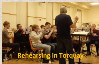
Rehearsing in Torquay

There was a heady mix of confidence and nerves as we occupied the stage...and then we were off. The back row started the piece superbly, with the trombones following and euphonium and cornet getting us into the heart of the first movement. The piece went by in a blaze of accurate rhythms and exciting dynamics, and by the time we reached the end we all knew that we had played it the best we had yet. Back in the auditorium, waiting for the results, a wave of excitement went through our players and supporters as the brass band website, 4barsrest, predicted us to win! Unfortunately, though, with the unfurling of the results, it soon became apparent it wasn't to be. We came 7th in the 3rd section - still our highest position ever, and something to be proud of - with the subjectivity of brass band contesting being highlighted. Needless-to-say, we performed, in all likelihood, the best we ever have on the contest stage, which gives us hope and confidence for the future! Many thanks to all those who supported the build-up to the day and to those intrepid supporters who accompanied us to Devon.